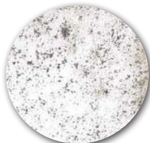
Standard plastic pan with visible mold

Microbes can double every 20 minutes on an untreated surface!